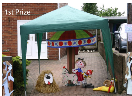
Scarecrow Festival Winner 2016